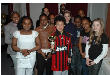
Shahck Out Juniors with the award for Performance Piece of the Year